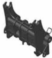
Quick-Tach System (QT) (available on all models)

Description: The Bobcat man platform gives you great flexibility in your work as it eliminates the need for scaffolding and safety nets while simplifying and speeding up the job. Bobcat man platforms are fully homologated and easily fitted to your machine without roll-up cables, thanks to the wireless remote control.