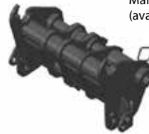
Manitou Carriage System (MT) (available on TL models only)