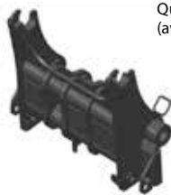
Quick-Tach System (QT) (available on all models)

Description: The extremely durable Bobcat® digging bucket is ideal for all types of digging and materials handling jobs. Available with or without teeth.