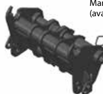
Manitou Carriage System (MT) (available on TL models only)