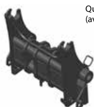
Quick-Tach System (QT) (available on all models)

Description: Add a crane jib and your telescopic handler is turned into a crane, but with all the advantages of its mobility and versatility.