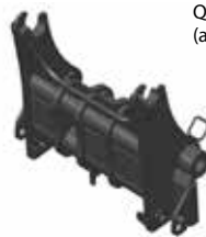
Quick-Tach System (QT) (available on all models)

Description: The Bobcat extension jib further increases your lift and reach capacity. Using this attachment, the telescopic handler can position loads in places which are difficult to access by conventional means.